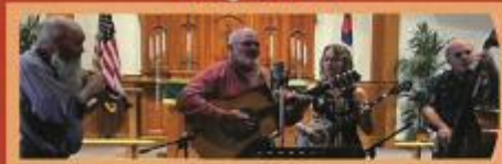
Highview Bluegrass Band, Webster, WI