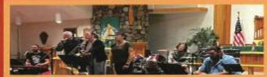
Holy Hootenanners, Mahtowa, MN