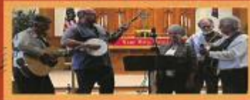
Northern Lights Revisited, Brook Park, MN