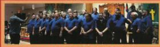
MN Adult/Teen Challenge, Central MN Coffee & treats served after concert!