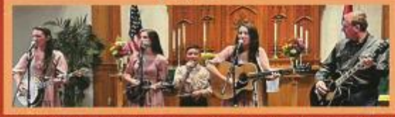
Roller Family Bluegrass, New Richmond, MN