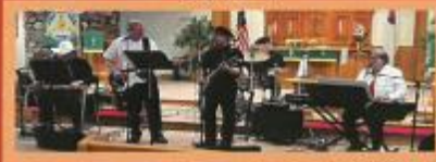
The Neighberz Band North Branch, MN