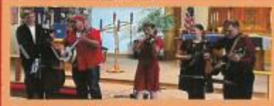
The Everstrom's Brook Park/Mora, MN