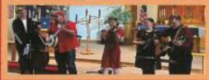
The Everstrom's Brook Park/Mora, MN