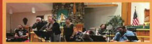
Holy Hootenanners, Mahtowa, MN