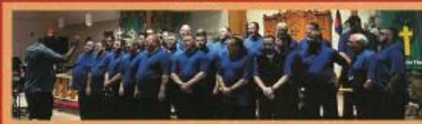
MN Adult/Teen Challenge, Central MN Coffee & treats served after concert!