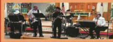
The Neighborz Band North Branch, MN