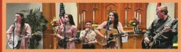
Roller Family Bluegrass, New Richmond, MN