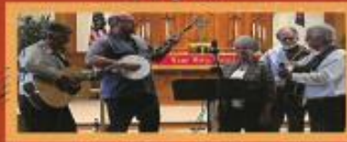
Northern Lights Revisited, Brook Park, MN