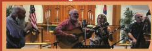
Highview Bluegrass Band, Webster, WI